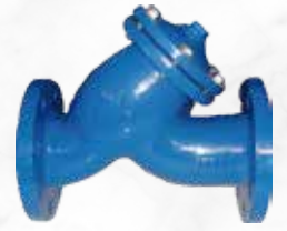
Y-Strainer with Flange