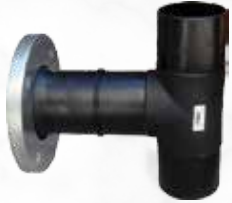
Equal Tee with Flange