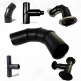
Segmented pet fittings