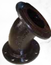
Double Flanged 45° Elbow