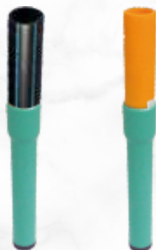
PE-Metal Transition Coupler