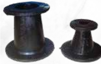
Double Flanged Reducer