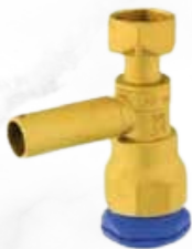
Tamper-proof Shut-off Valve before Meter