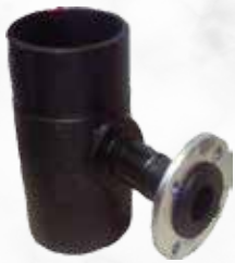
Reducing Tee with Flange