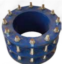
Dismantling Joint • Available in the range DN 60 to DN 2000