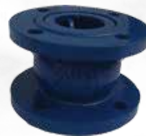
Axial Disc Check Valve