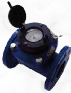
Irrigation Water Meter