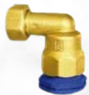
Female Thread-to-Pipe Elbow Connector OR Captured Nut Elbow Connector