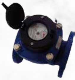
Water Meter Type Waltman Class B