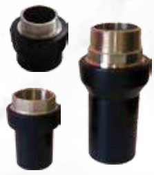
Threaded connection pet brass