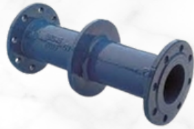
Double Flanged pipe with flange in the middle