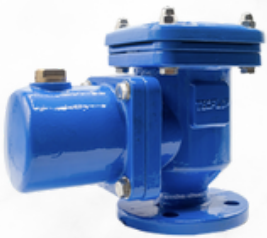
Air release valve double ball • PN 10/16/25