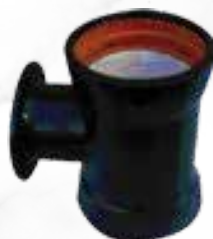
Socket Flanged Tee