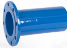
spigot flanged pipes