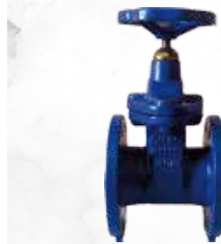
Gate Valve with Elastomer Seated Wedge • F4 Series • PN 10/16/25 • made of Ductile Iron (GGG50) • available in the range DN 40 to DN 500