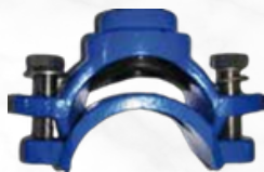
TAPPING Saddle • for Cement Pipes • for Polyethylene Pipes