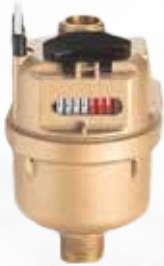
Domestic Water Meter