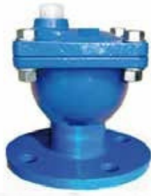
Single ball Air Release Valve • PN 10/16/25