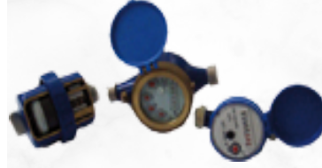
Water Meter Class C