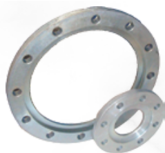
Galvanized Steel Flange for PE flange adaptor • PN 10/16/25