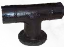
Spigot-Spigot Flanged Tee