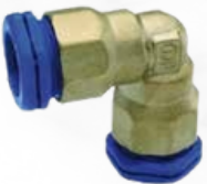
Pipe-to-Pipe Elbow Connector