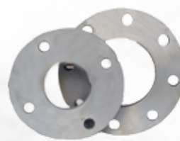
Weld Flange • PN 10/16/25