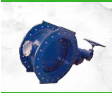
Butterfly Valve with Flange • Series 14 • PN 10/16/25 • made of Ductile Iron (GGG 50) • available in the range DN 150 to DN 2000