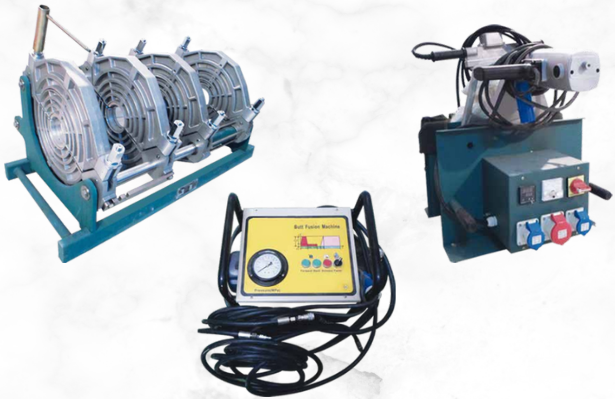
Manual Welding Machine, available in the range from DN 40 to DN 160.