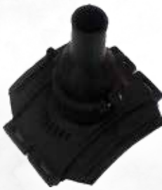
Electrofusion Tapping Saddle