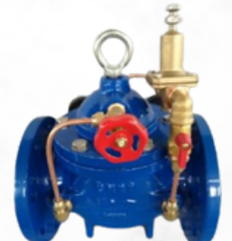
Pressure reducing valve