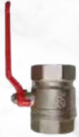
Full Bore Ball Valve AND Reduced Bore Ball Valve