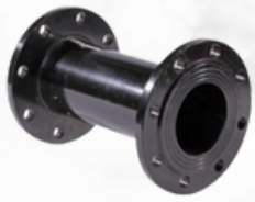
Double Flanged pipe