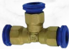
Pipe-to-Pipe Tee Fitting