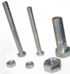
Bolts and Nuts • Stainless steel • Electric Galvanized