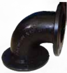
Double Flanged 90° Elbow