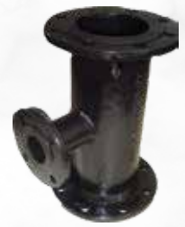
All Flanged Tee