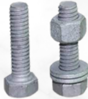
Hot dip galvanized Bolts and Nuts