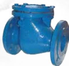
Single Flap Check Valve