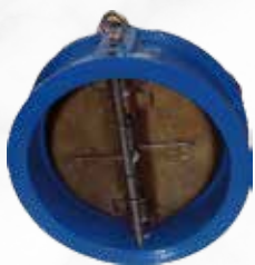
Double Flap Check Valve