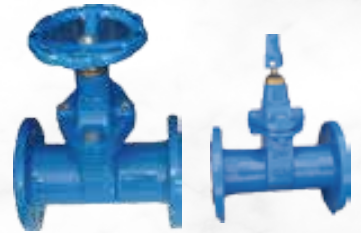
Gate Valve with Elastomer Seated Wedge • Long F5 Series • PN 10/16/25 • made of Ductile Iron (GGG 50) • available in the range DN 40 to DN 500.