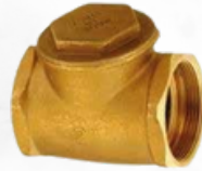
Swing Check Valve