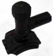
Electrofusion Tapping Saddle