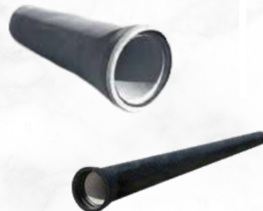
Ductile iron pipes